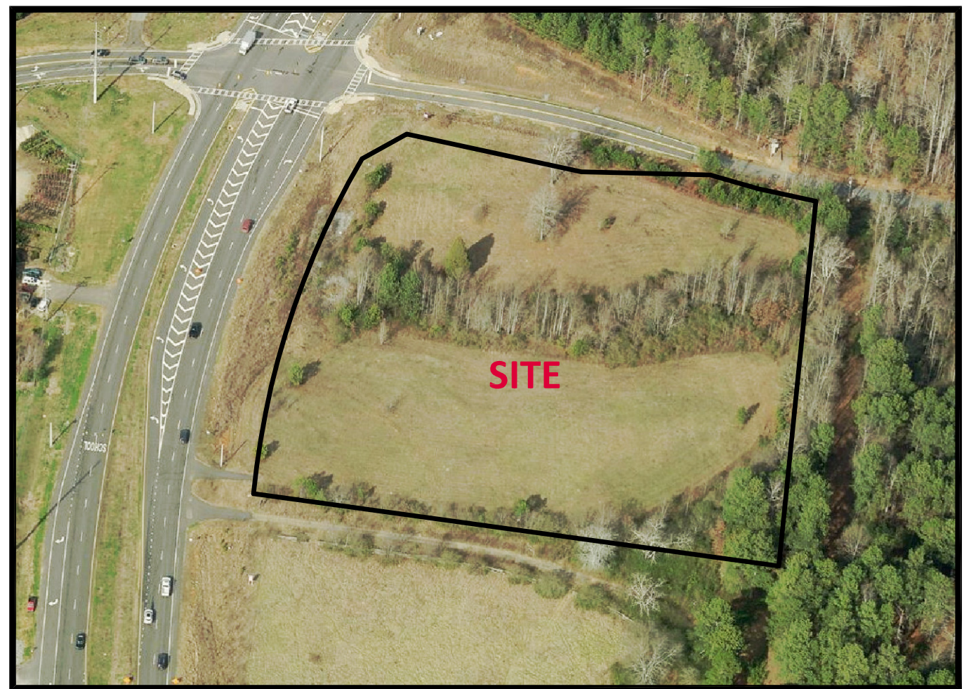
AERIAL IMAGE

REQUIRED STORMWATER DETENTION AND WATER QUALITY WILL BE PROVIDED FOR EACH SITE. DETENTION WILL BE UNDERGROUND UNLESS A MORE FEASIBLE SOLUTION IS DESIGNED.